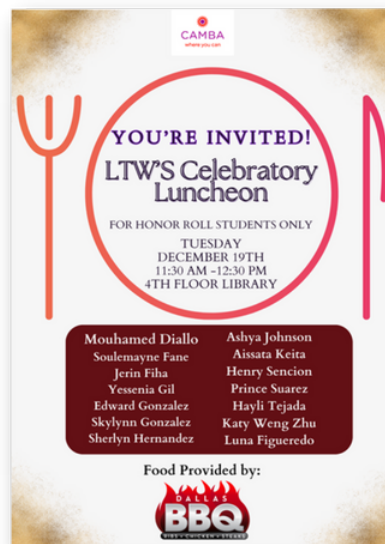
CAMBA sponsored lunch for Honor Roll