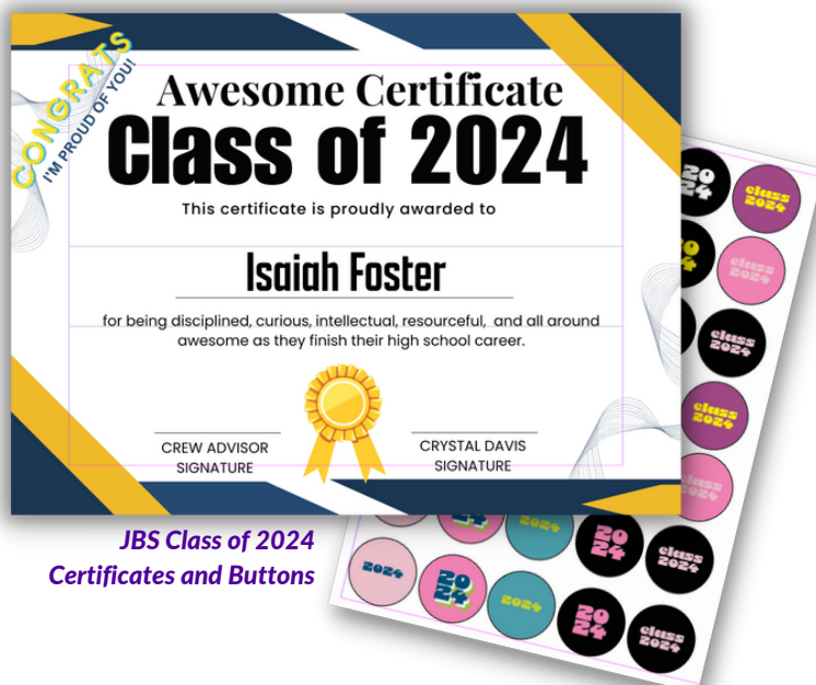
JBS Class of 2024 Certificates and Buttons

December marked the start of us celebrating the Class of 2024. We started with the Senior Breakfast on Dec 13. Advisors and administrators gave senior pep talks. Certificates of Awesomeness were awarded. The breakfast was sponsored by CAMBA and Learning to Work. Senior Photos took place on Dec 20. Our celebration will continue during End Term Ceremony on January 22 with Core Value and academic awards. Graduation is Friday, June 21, 2024. Mark your calendars!